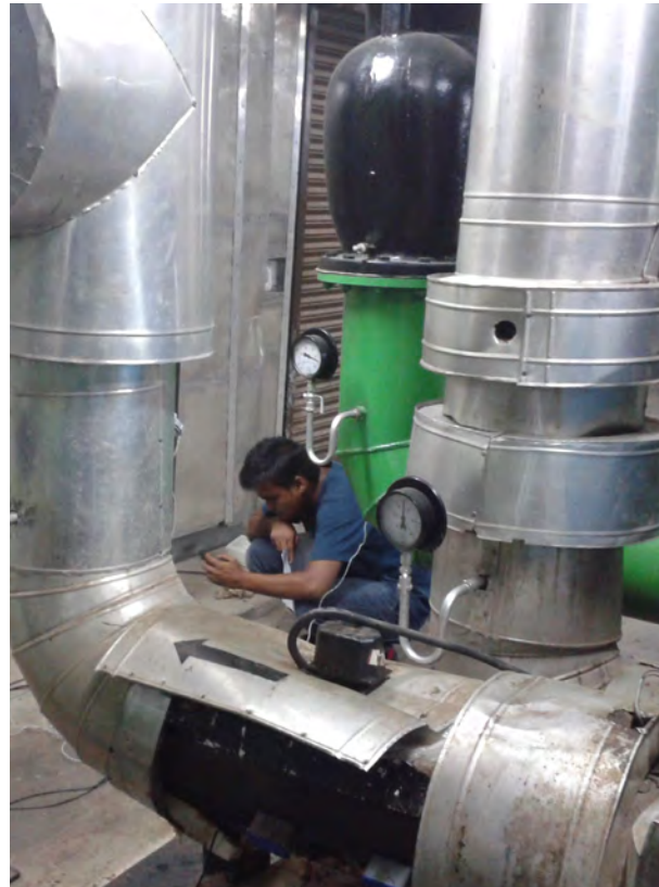
Fieldwork at Malaviya National Institute of Technology Jaipur

performance of building in terms of comfort/ service level as well as energy efficiency throughout building design, construction and operation through predicting, measuring, tracking and benchmarking by feedback loop.