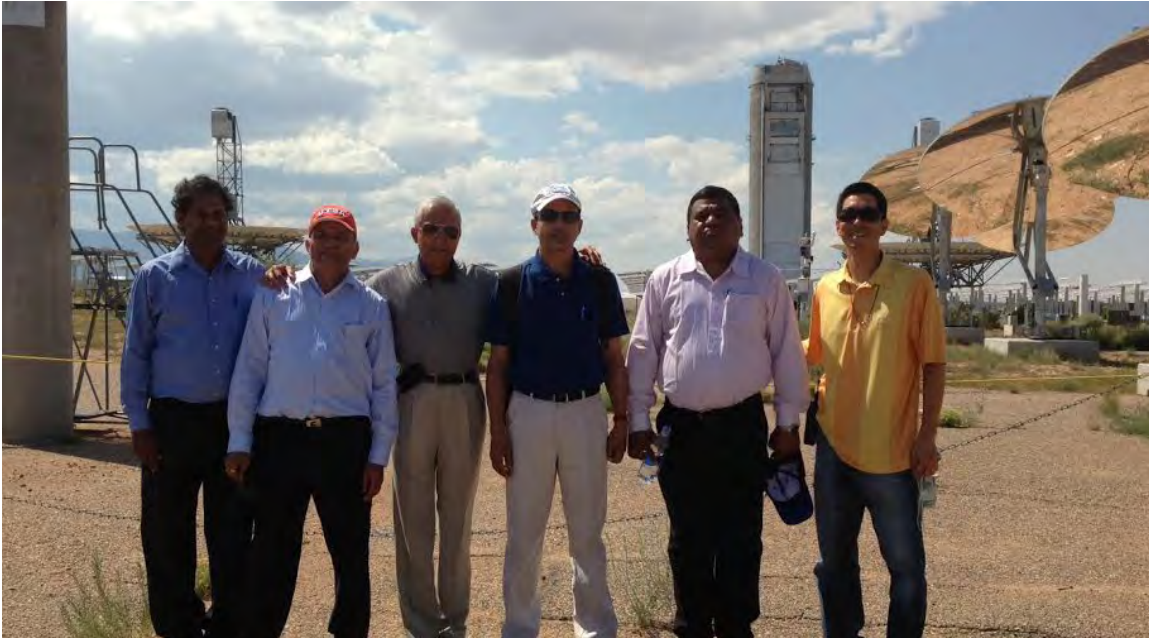
SERIIUS Researchers at the National Solar Thermal Test Facility at Sandia National Laboratories

Research and development is organized under Research Thrusts, with cross cutting competencies under the Competency Gateway, both of which report directly to the Co- Directors. The research projects are coordinated by Project Leads, who are accountable to the Thrust Leaders.