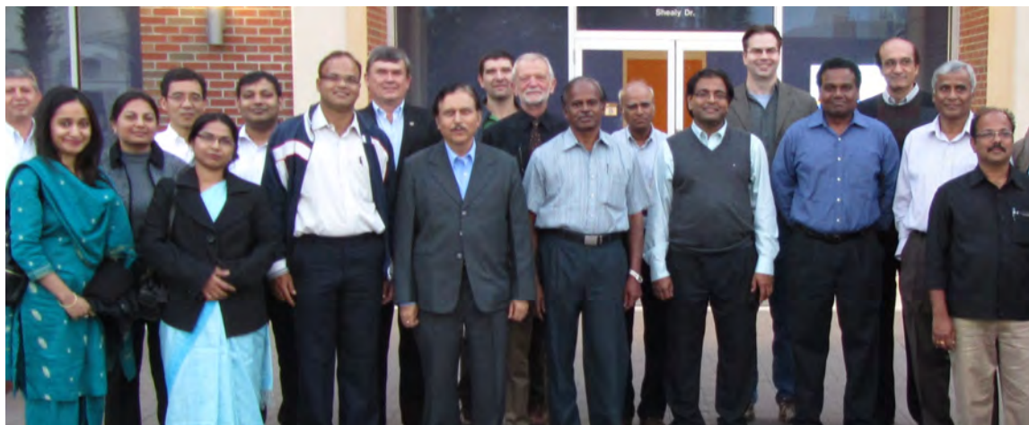
Participants of the Joint Project Meeting of the U.S.-India JCERDC for Development of Sustainable Advanced Lignocellulosic Biofuel Systems at the University of Florida, Gainesville