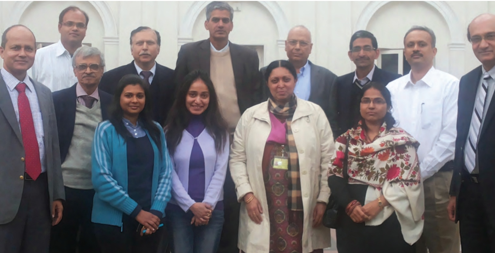
Consortium Principal Investigators and Co- Principal Investigators with representatives from the Department of Biotechnology, Department of Science and Technology and the Indo-U.S. Science and Technology Forum at the Internal Coordination Meeting on 17 January 2014

Enterprise Expertise Bi-national Industry Technology Projects Biotechnology University Partnership Engineering Research Energy Development Science