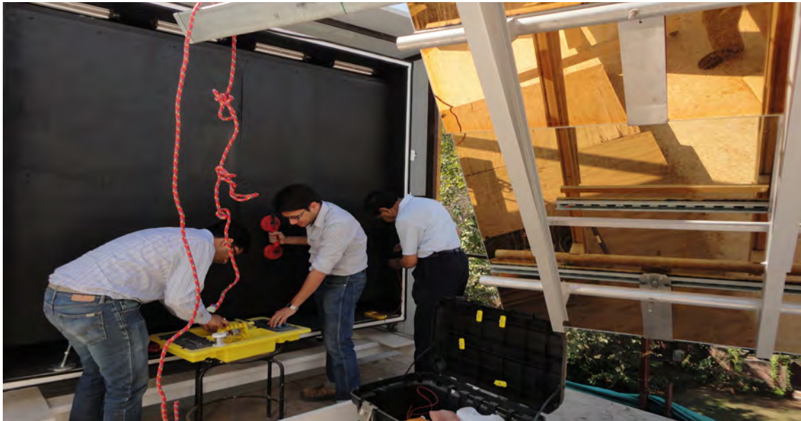
Window testing being conducted at CEPT University-Ahmedabad

demonstrate concepts to promote high efficiency buildings as well as educate and train building stakeholders.